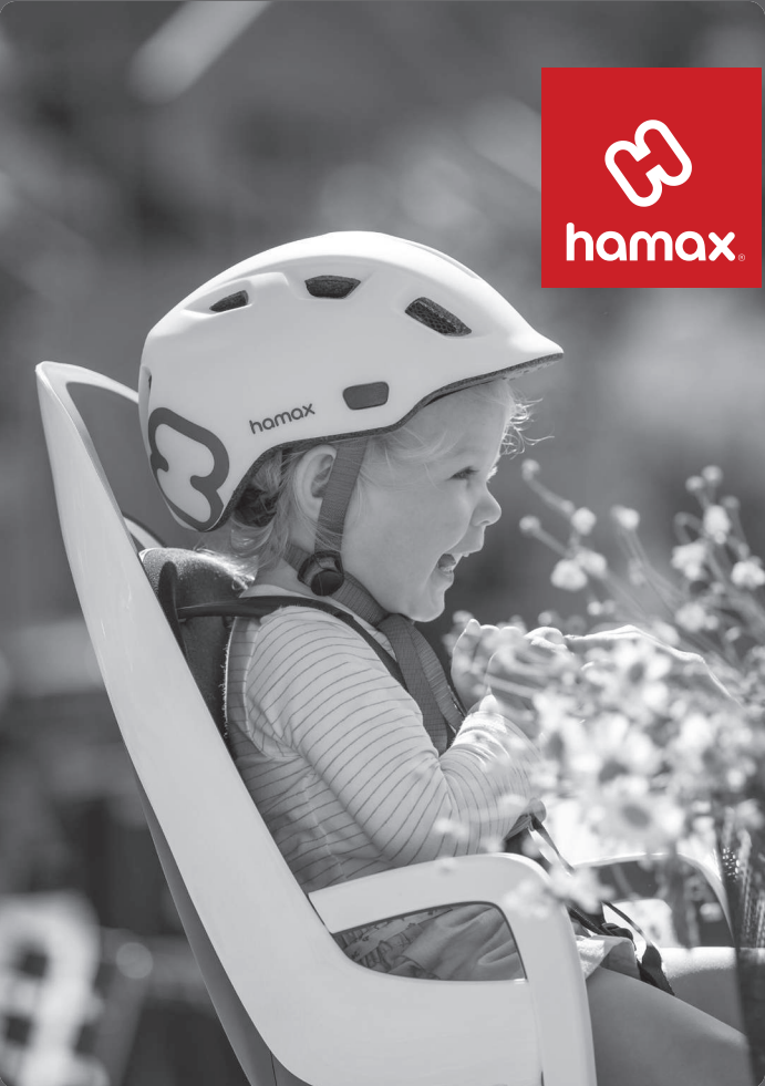
Hamax id: 12204, rev. 003, Safety instructions carrier mounted seats CS

EN Bicycle Child Seat with carrier mounted adapter